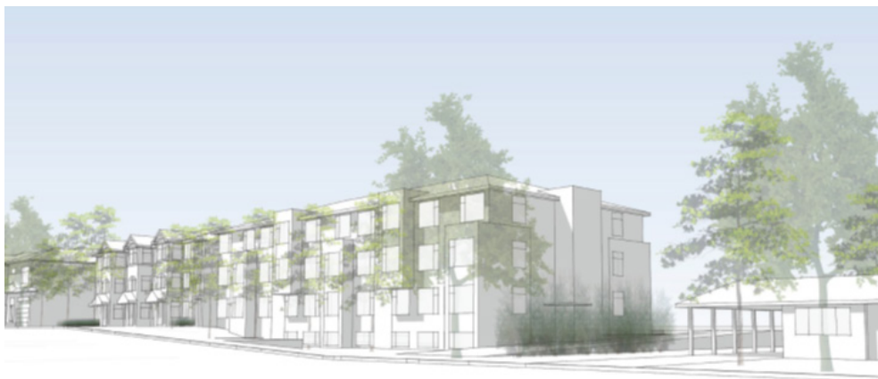
Architect's concept of Ellwood House with Ellwood House Extension (source: Colizza Bruni Architecture)