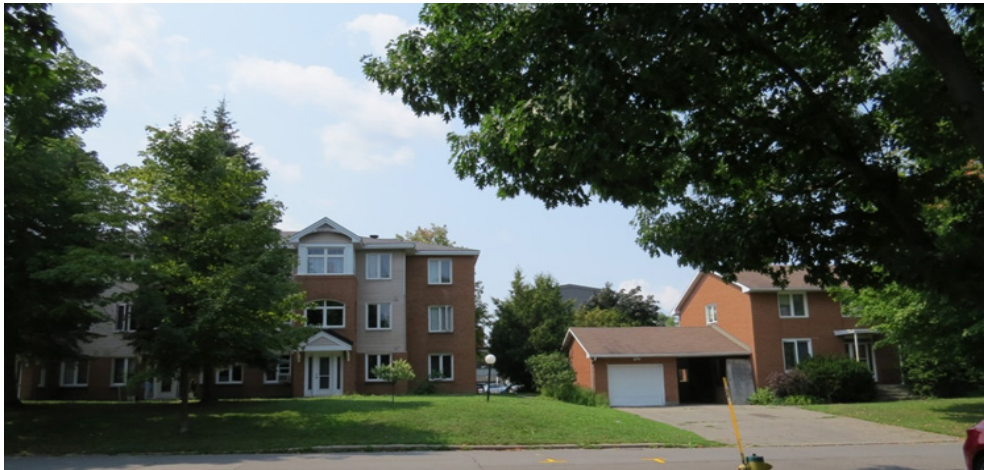
Ellwood House (left) and former St. Thomas rectory, 2270 and 2262 Braeside Avenue